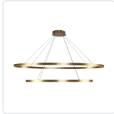
CH79253-BG Brushed Gold